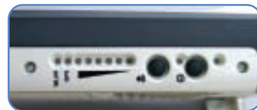
Front view, close-up